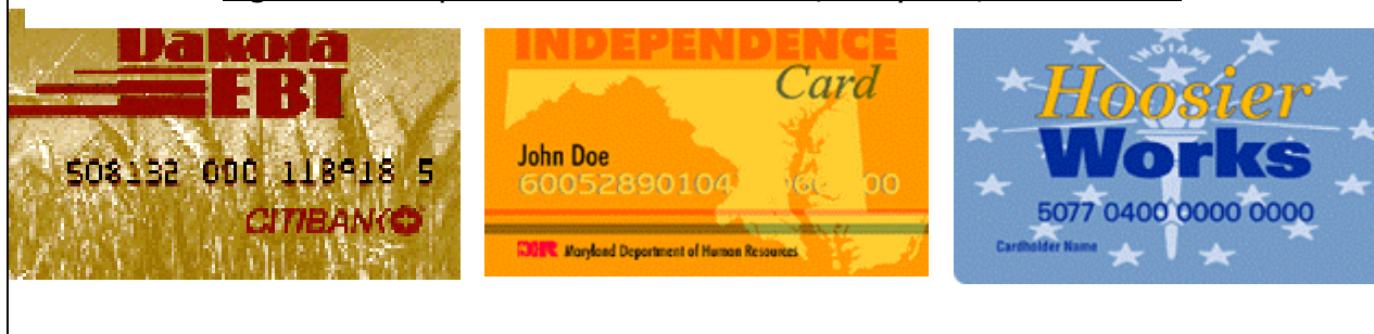
Figure 1: Sample EBT Cards – Dakotas, Maryland, and Indiana

EBT allows food stamp benefit recipients to pay for goods by transferring funds from a government-maintained account to a retailer’s bank account. In most states that deliver food stamp benefits via EBT, benefit recipients receive a plastic card with a magnetic stripe that resembles a debit card (see Figure 1) and a personal identification number (PIN). When benefit recipients purchase food, they inform the clerk that they wish to pay with EBT, swipe their cards at a POS terminal located at the cash register, and enter their PIN.